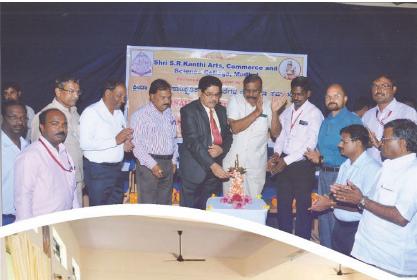
Inauguration of Gymkhana & Cultural Activities 2017-18