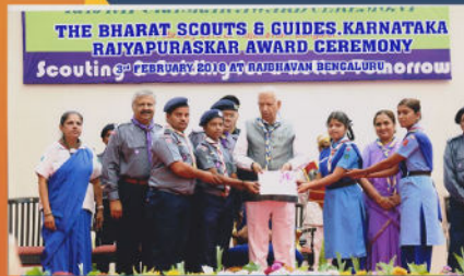
State Awards to Our College Rover and Ranger