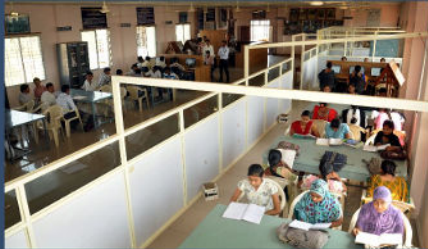
Library & Reading Room