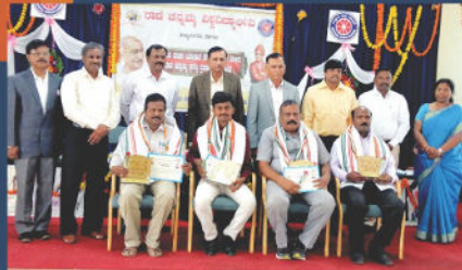
R.C.U. Best N. S. S Unit & Volunteer Award