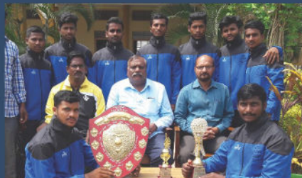
R.C.U Kabaddi Champions